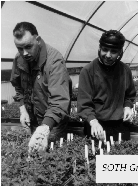
SOTH Greenhouse workers

We are looking for photos of consumers with developmental disabilities on the job to publish in the newsletter. Do you have photos you want to share? We will need a signed release to use them in the newsletter. To obtain a release form, contact one of the editors at the address on page 3.