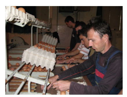
With USAID assistance, Koni Soni egg producer has improved its business practices, enabling the company to recapture the domestic market. As a result, most eggs consumed in Kosovo today are now produced domestically.