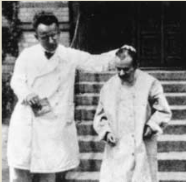
Karl-Bonhoeffer-Nervenlinik, Berlin, Germany.

A physician displaying a patient at the Karl-Bonhoeffer psychiatric clinic. Berlin, Germany.