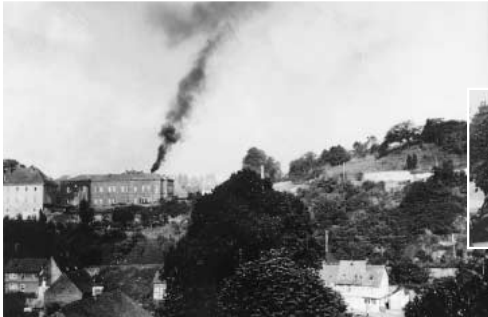
The Hadamar "euthanasia" center. In all likelihood the smoke is from the crematoria. Hadamar, Germany, 1941.