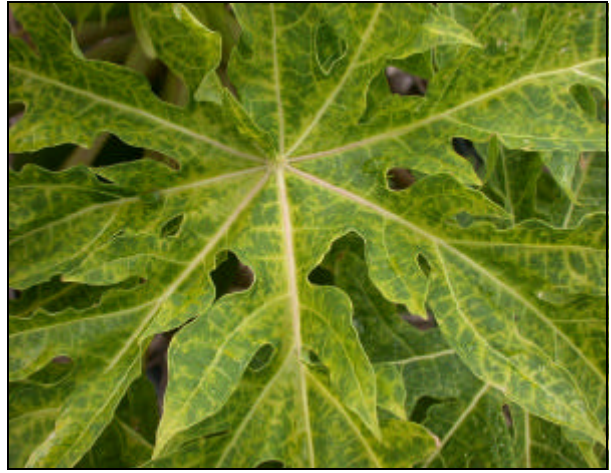
Maui, near Wailuku. 4/4/02. Papaya leaf with PRV symptoms.