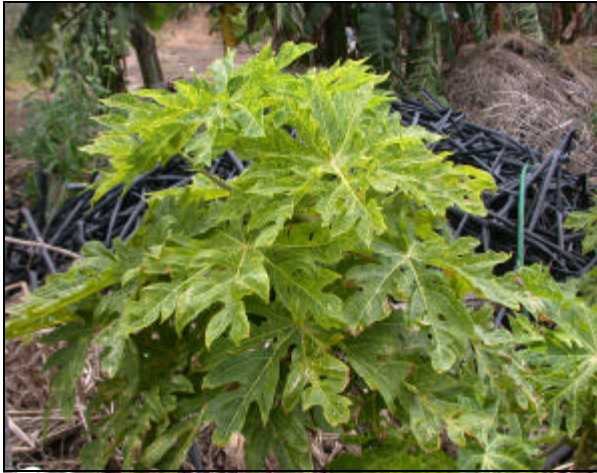
Maui, near Wailuku. 4/4/02. Papaya plant with PRV infected foliage.