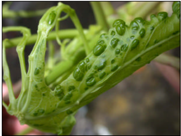
Wailuku, Maui. 4/4/02. Foliar "green islands" resulting from PRV infection.