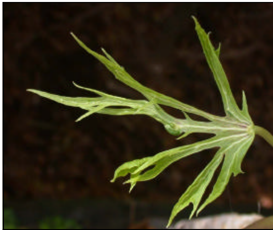
Wailuku, Maui. 4/4/02. Papaya leaf exhibiting "shoestring" appearance. HDOA Survey photo