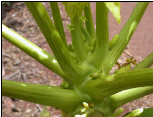
Maui Tropical Plantation. 4/4/02. Papaya plant exhibiting PRV water-soaking on petioles.