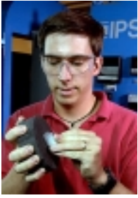
ORNL researcher's cool material,