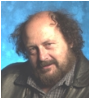
LANL researcher studies the "bystander effect"