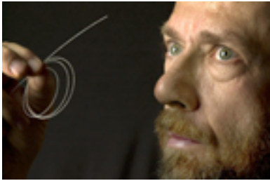
Fiber optics assist energy exploration,