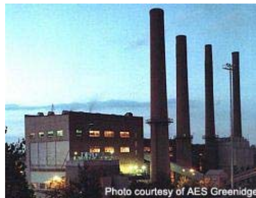
The photo shows a view of the Greenidge power plant facing northeast. Turbine generator Unit 4, a 107-MW output reheat unit, is at left.