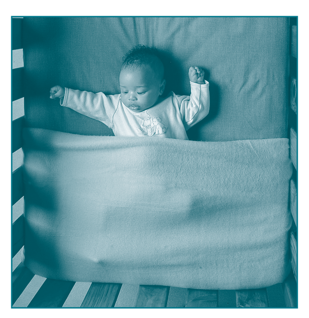
If parents use a blanket, they should place the baby with feet at the end of the crib. The blanket should reach no higher than the baby's chest and should be tucked under the crib mattress to ensure safety.