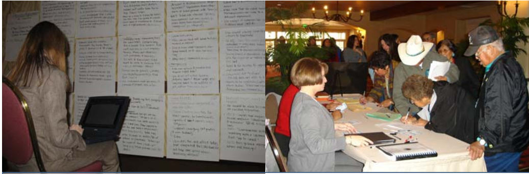
Staff inputs public comments into a database at an Indian Affairs regulations consultation meeting in Portland, OR (left), and helps register attendees at the consultation meeting in Albuquerque, NM (right).