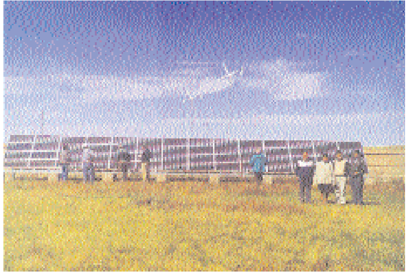
PV-wind hybrid systems are commonly used for rural electrification ISP

The US Department of Energy's (DOE's) National Renewable Energy Laboratory (NREL) and ISP are working with JKD – entrusted by SDPC to be responsible for the training element of the Township Electrification Program– to establish a training certification system for the Township Electrification Program. The framework is based on the foundation developed for solar home systems for the Chinese Government's Brightness Program, which was initiated with an action plan in 1996 at the 'Global Solar Energy Summit