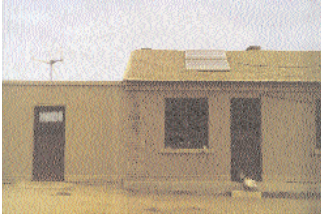
PV-wind hybrid system for an Inner Mongolian home isp

linked to the performance of the power system and the delivery of power to each customer and collection of customer payments. More private sector involvement from energy service companies and others will help the government to create and establish stable policy guidelines.