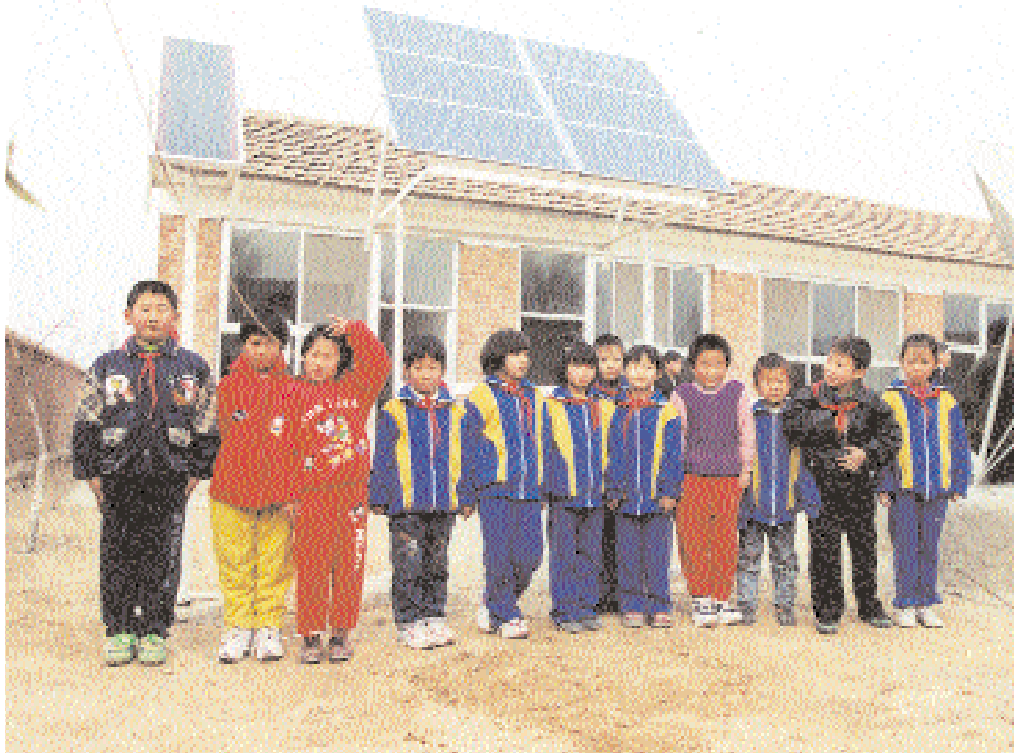
Township electrification with PV follows on from experience with installations further east, such as this school near Beijing DEBRA LEW