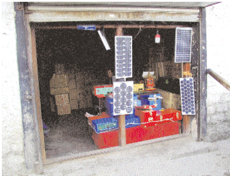
Selling solar: PV on display at a shop in Tibet

The Provincial Development Planning Commission (DPC) issued tenders for the Township Electrification Program: one for systems integrators to design, procure and install systems and another for service companies to operate and maintain