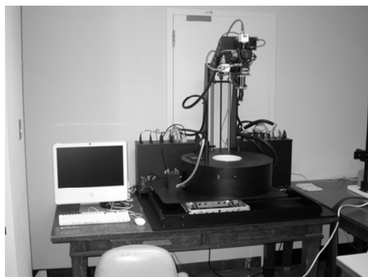
The microscope allows researchers at the Natural History museums in Washington, DC, London, and Paris to remotely view specimens.

In 2004, the FAR-B Board of Directors felt FAR-B should be doing more to help the research effort at BARC. One way to do this would be to help fund new research equipment. After discussion with the Area Office, the FAR-B Board of Directors funded $25,000 for the Systematic Entomology Lab to help purchase a state-of-the-art Remote Imaging System (RIS) built by Photografix, Inc. that allows researchers at the Natural History museums in Washington, DC, London, and Paris to remotely view specimens, particularly type specimens, that determine the valid taxonomic name.