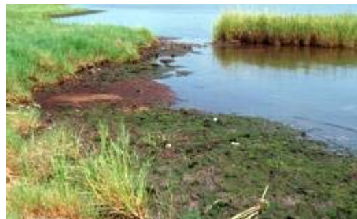
Northern shoreline of Lake Mechant showing the saltmeadow cordgrass ( Spartina patens ) dominated marsh eroding behind a large stand of smooth cordgrass ( Spartina alterniflora ) left standing at the water's edge.

Project Type: Dredged Material, Marsh Creation, Vegetative Planting