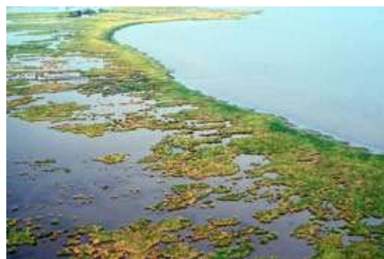
Aerial photo of the shoreline of Lake Mechant showing the narrow lake rim and deteriorating marsh to the north. Dredged material will be pumped into this broken marsh to create new marsh to maintain this land bridge.

Should shoreline breaching and enlargement of tidal channels allow high tidal energy conditions to intrude into the project area, the organic interior marshes would likely experience increased loss rates.