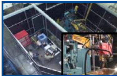
ORNL HDI Facility

The University of Kentucky partnering strategy is with coal, mineral, aggregate mining companies, a screen manufacturer, and a chain manufacturer is designed to facilitate the development and commercialization process. If the technology is evaluated to be technically effective and economically feasible, the screen manufacturer and chain manufacturer will license and commercialize the technology first at the participating mining companies and then to the entire mining industry.