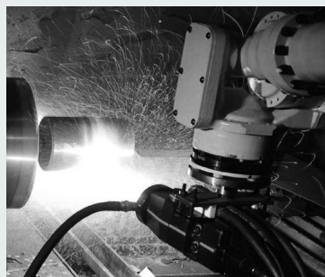
(Left) Steel matrix composites. (Right) Thermal spray coating process.