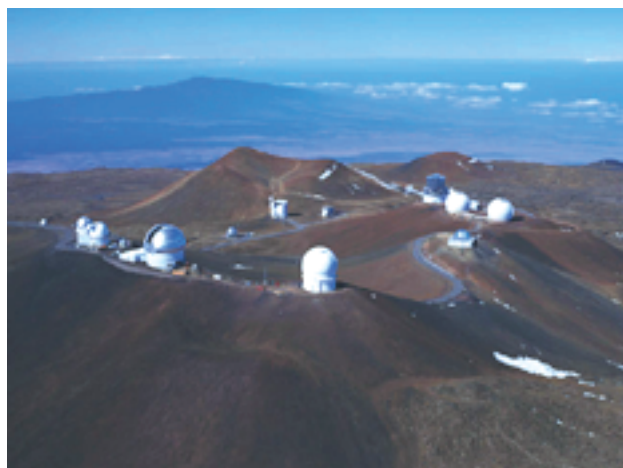
The Mauna Kea Telescopes