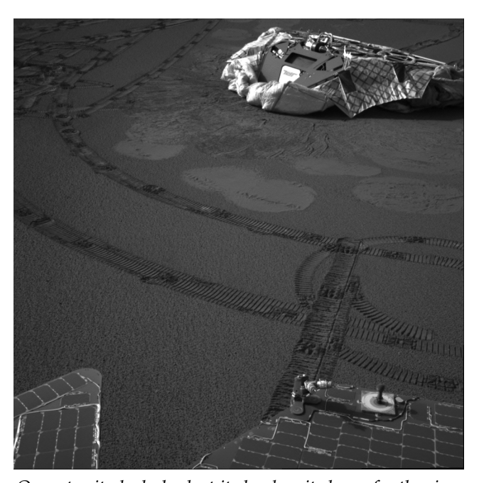
Opportunity looks back at its lander--its home for the sixmonth cruise to Mars. Rover tracks, bounce marks, and airbad retraction marks are visible around the lander. The calibration target or sundial, which both rover panoramic cameras use to verify the true colors and brightness of the red planet, is visible on the back end of the rover.

The excitement over the landing of twin rovers on Mars had been building for months, nurtured by initial education and public outreach activities during the 7-month flight to Mars. The expected wave of public attention came, as the world watched live television and web broadcasts, holding a collective breath during the critical six minutes of entry, descent, and landing. Within days, there were thousands of emails wishing congratulations that ranged in tone from the spunky to the spiritual. And then came the questions!