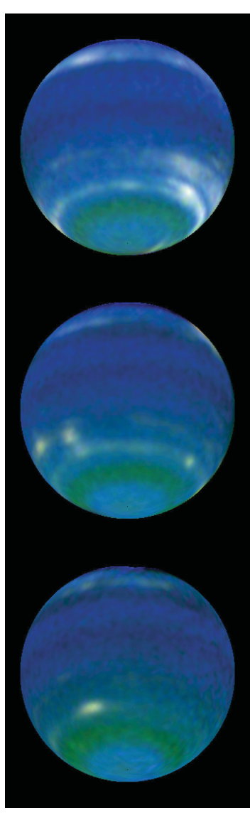
Images of Neptune taken by the Hubble Space Telescope show the dramatic changes in the brightness and width of high altitude cloud bands.

Recent, dramatic observations from the Hubble Space Telescope (HST) have shown significant observable changes in Neptune's