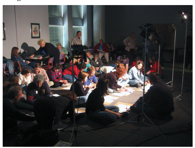
An educator workshop where 170 teachers worked on a sundial activity that correlates with the sundials(marsdials) carried by each rover.

Even at the lower grades, teachers are reporting student progress as a result of interest in the rovers. New classroom activities called "Roverquest" enable students to follow along with mission discoveries as they happen and compare Mars to Earth. Anecdotally, an elementary-school teacher sent in a report from a student who hadn't been interested in schoolwork throughout the year, but had voluntarily gone home and written a 5-page report (with pictures!) that hadn't even been assigned.