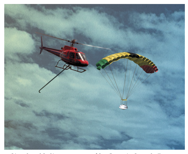
Simulated helicopter snag ofthe Genesis Sample Return Capsule

Making a dramatic entrance on September 8, 2004, NASA's Genesis Sample Return Capsule (SRC) returns to Earth in an astonishing mid-air capture over the Utah Test and Training Range. In anticipation of this exciting event, the Genesis mission Education and Public Outreach team has lots of opportunities for classroom and public engagement. Museums, science centers, and planetariums will serve as the hosts for a series of summer educator academies, leading up to a September 8 public sample return event in Salt Lake City. For learning materials, fun kids' activities, and more mission information, visit <a href="http://genesismission.jpl.nasa.gov/">http://genesismission.jpl.nasa.gov/</a>.