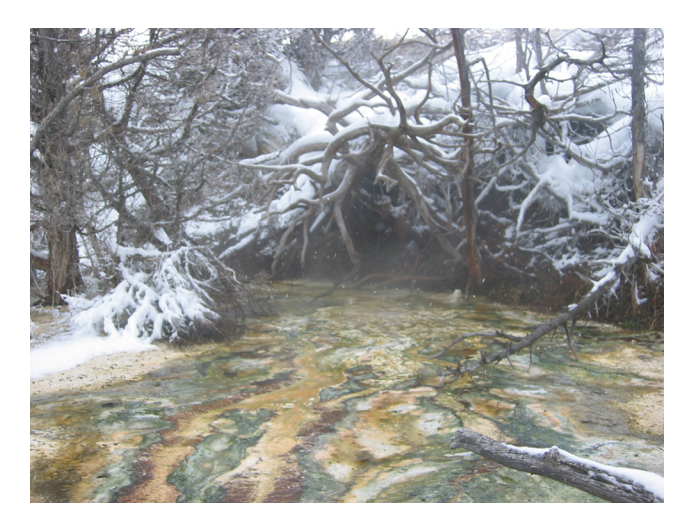
White Elephant Back Annex spring, near Mammoth Hot Springs in Yellowstone National Park.

thermophiles that lived up to four billion years ago. Comparing the fossil record from Yellowstone to rocks collected by the Mars Rovers, Spirit and Opportunity, may enable us to recognize evidence of past life on Mars.