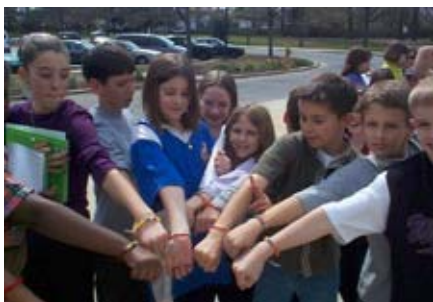
Students show their UV-sensitive bracelets.

The Sun-Earth Day website is http://sunearth.gsfc.nasa.gov/SECEF_SunEarthDay