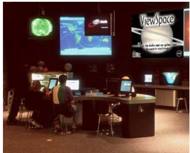
View Space showing in the Maryland Science Center.

To run View Space in their facility, a host