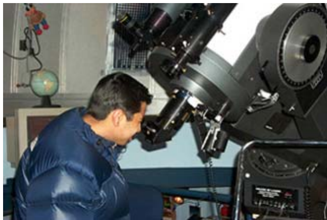
Students in Observational Astronomy practice using the 16-inch telescope at the Astrophysical Observatory at the College of Staten Island.

By creating a multi-campus research alliance, NYC-SSRA will engage underrepresented students and faculty from colleges and high schools in NASA Space Science research and education projects. NASA OSS support is enabling the establishment and enhancement of the space science research capabilities of faculty in participating colleges; creating a pipeline of research activities from high school to graduate school; and integrating research and research-related activities into undergraduate programs. The creation of the space science BS degree in the CUNY Baccalaureate Program is a major accomplishment and one that could not take place without the cooperation between institutions brought about by NYC-SSRA. This effort will help