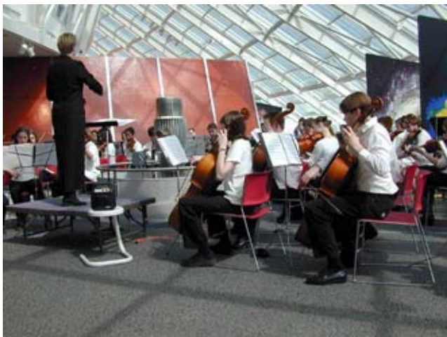
Batavia Middle School 7 th and 8 th Grade Orchestras performing their original composition interpreting Black Holes.

for me to share my excitement about astronomy with other people.”