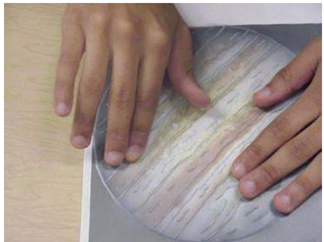
The input from the students at the Colorado School for the Deaf and the Blind was a crucial step in the process of creating the tactile overlays for “Touch the Universe”. This picture shows a student exploring a prototype image of Jupiter.

Hubble images. The reader is taken on a journey of discovery to more and more distant objects, starting with images of the telescope itself in orbit, and ending with the Hubble Deep Field. Each