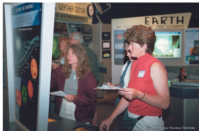
Denver teachers on an informational "scavenger hunt" at the exhibit as part of a full day educator workshop.