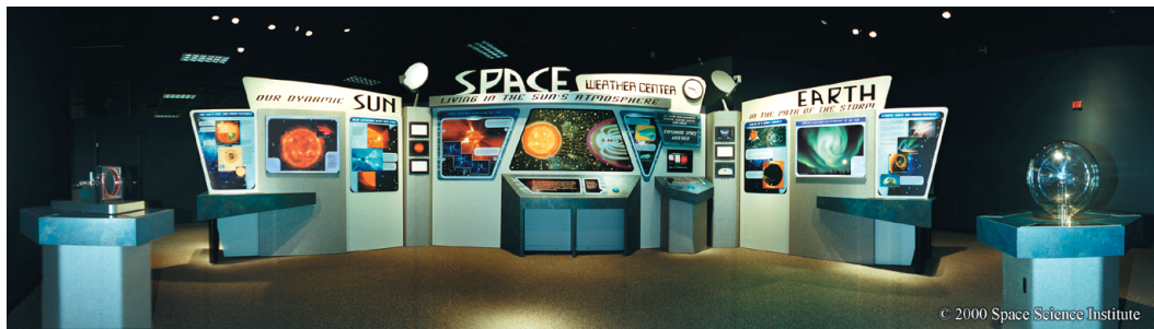
A novel partnership between the Space Science Institute and several Sun-Earth Connection missions produced the Space Weather Center traveling exhibit with funding from NASA and the NSF.