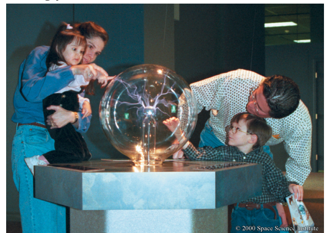
A family enjoys the plasmasphere interactive during the exhibit's opening display at the Denver Museum of Nature and Science.

Thus far, the exhibit has been to Denver, Sacramento, and Baltimore, and will travel to NASA GSFC, Chicago and other venues in the coming year.