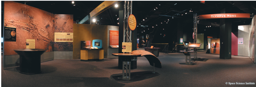
The MarsQuest exhibit will be in Orlando for Spring 2001 and in Tucson for Summer 2001.