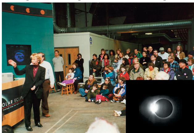
At the Exploratorium, August 1999.