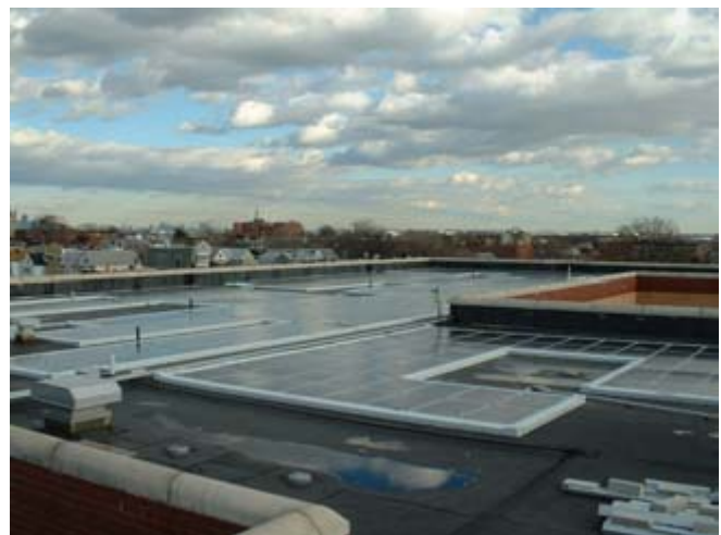
Figure 1. Rooftop PV array on Bayonne, NJ high school