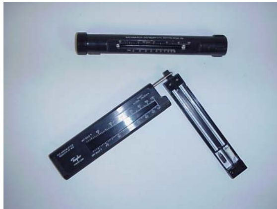
Figure 17-3. Sling Psychrometer

This is a hand-held instrument consisting of two thermometers mounted side-by-side on a narrow support. The support is connected to a handle by a swivel. One thermometer measures the dry bulb temperature while the other measures the wet bulb temperature. By reading both thermometers, the sling psychrometer can determine relative humidity using the chart supplied with the instrument. However, for heat stress screening, only the wet bulb thermometer is used.