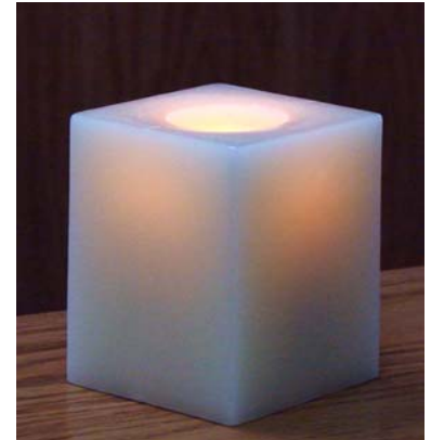
An example of one of the 6x6 inch flameless candles available from OSFM.

The Congressional Fire Service Institute (CFSI) is promoting the candles to organizations to consider including as part of their prevention and fund-raising efforts.