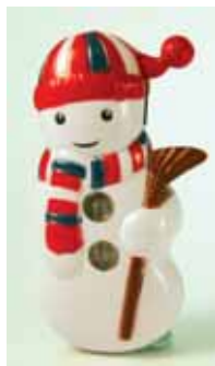
This Christmas tree and snowman lighter are highlighted in the OSFM video.