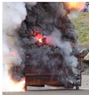
Illegal fireworks go up in smoke.