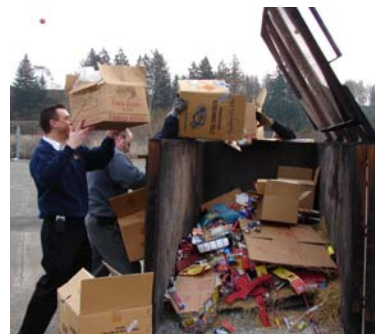
Loading fireworks into the high-temp carbon steel burn bin.

Burns will continue until the current stock of confiscated fireworks is destroyed.