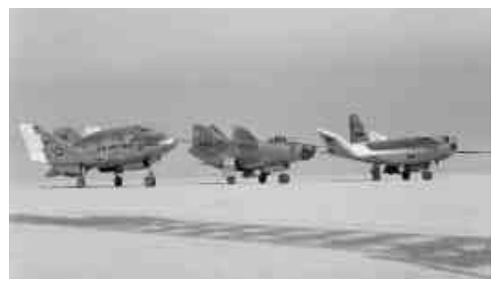
Three lifting bodies on the lakebed (X-24A, M2-F3, HL-10).

Five heavyweight designs were flown at Dryden from 1966 to 1975. They were the M2-F2, M2-F3 (rebuilt from the M2-F2 following a landing accident), HL-10, X-24A, and X-24B (rebuilt from the X-24A in a new configuration).