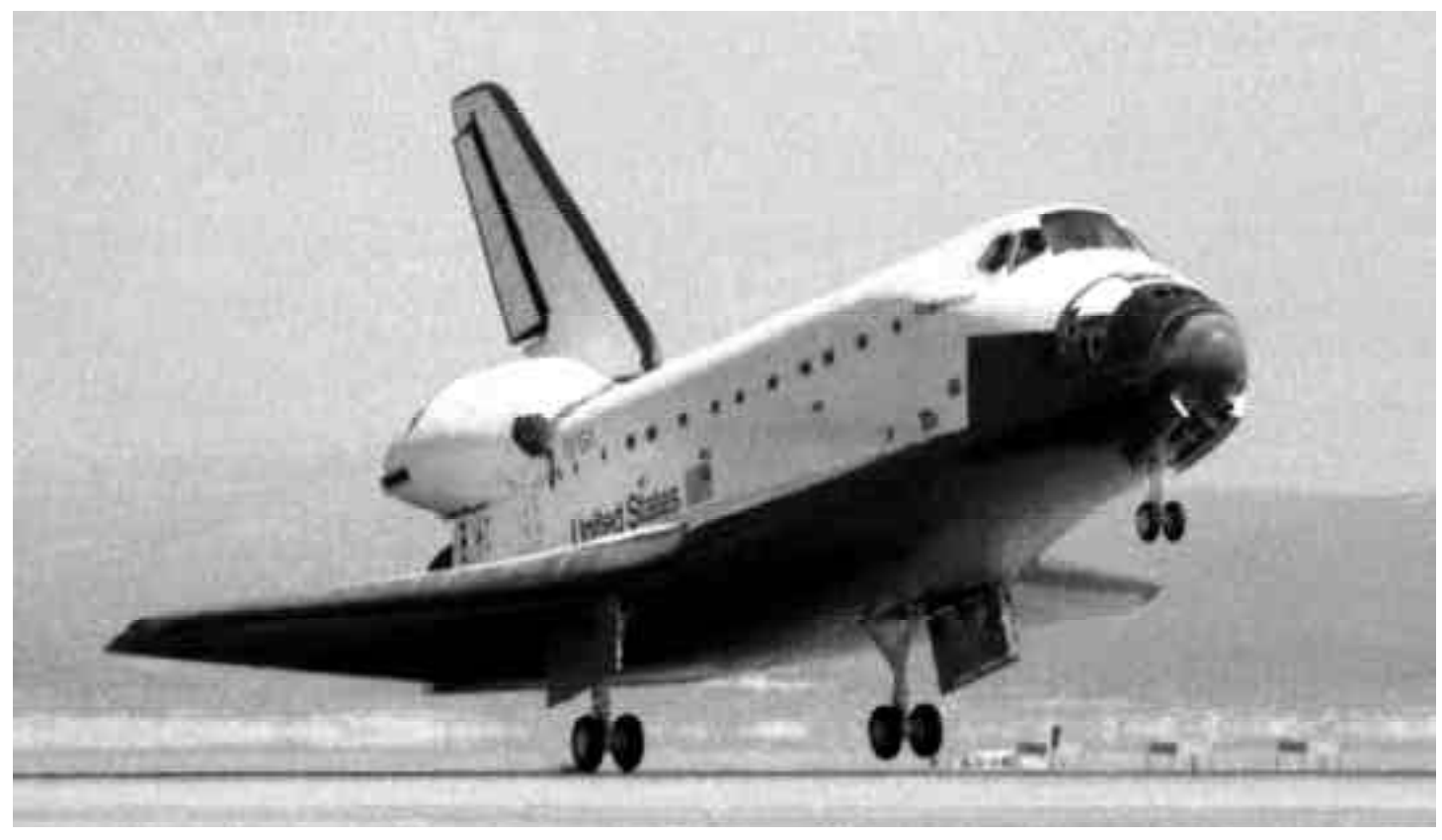
STS-67 Endeavour landing at Edwards.

Among the most prominent aerospace projects associated with the NASA Dryden Flight Research Center, Edwards, Calif., is the Space Transportation System (STS) — the space shuttles developed and operated by NASA.