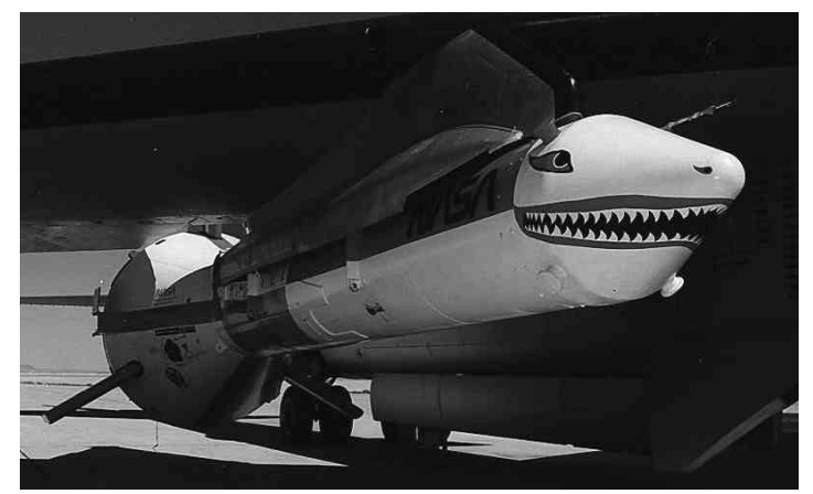
Simulated (smaller) version of the shuttle's solid rocket booster under the wing of the B-52.

The tests, using a dummy solid rocket booster, verified the performance and reliability of the parachute recovery system used now to recover the solid rocket booster casings after they separate from the shuttles' external fuel tank during launch operations. The booster casings are refurbished for reuse after they are retrieved from the ocean.