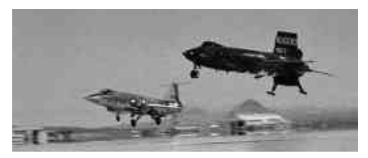
X-15 #3 and F-104A chase plane landing.

Using three research vehicles (one was lost in an accident late in the program), 12 pilots assigned to the program at the Flight Research Center collected a wealth of data between 1959 and 1968 on 199 research flights. Much of this information fanned out across the aerospace industry and has been applied to commercial and military aircraft and to the nation's space programs.