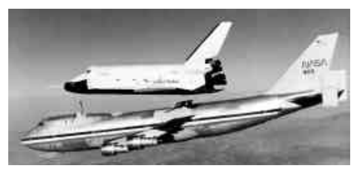
Enterprise separates from 747 SCA for first tailcone off free flight.

Four of the free flight landings were made on Rogers Dry Lake at Edwards. The final free flight landing was on the main 15,000-foot concrete runway at Edwards.