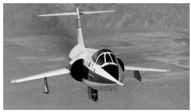
F-104 engaged in shuttle tile research.

In 1980, Dryden research pilots flew 60 flights to test space shuttle thermal protection tiles under various aerodynamic load conditions.