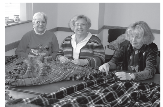
Members of the Chemeketa Chapter Daughters of the American Revolution work on lap robes for veterans and returning wounded servicemembers from Iraq and Afghanistan.