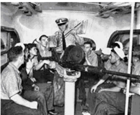
"U.S. Merchant Mariners receiving gunnery training from U.S. Navy Armed Guards"

Without the service of these sailors, many more ships would likely have fallen prey to enemy surface ships, submarines and aerial attack. Their sacrifice, tenacity and valor will never be forgotten.