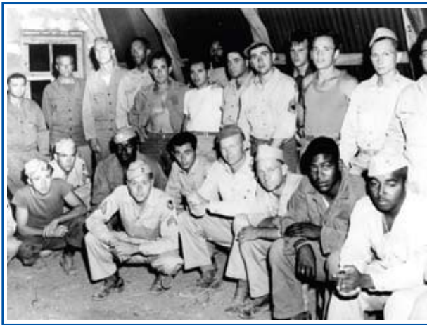
The United States Armed Forces has been desegregated since the 1948 "Executive Order 9981," signed by Harry S. Truman.