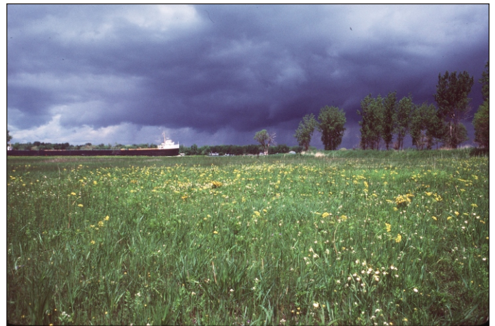
Walpole Island prairie in the St. Clair River delta.

For further information related to the state of the St. Clair - Detroit River Ecosystem, refer to the State of the Great Lakes 2005 report which, along with other Great Lakes references, can be accessed at www.epa.gov/glnpo/solec . Information on the St. Clair and the Detroit River RAPs can be accessed at www.on.ec.gc.ca/water/raps/stclair/implement_e.html and www.epa.gov/glnpo/aoc/detroit.html#status .