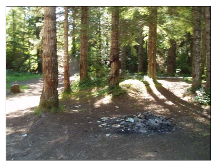
Camping area damaged by off-road vehicle use