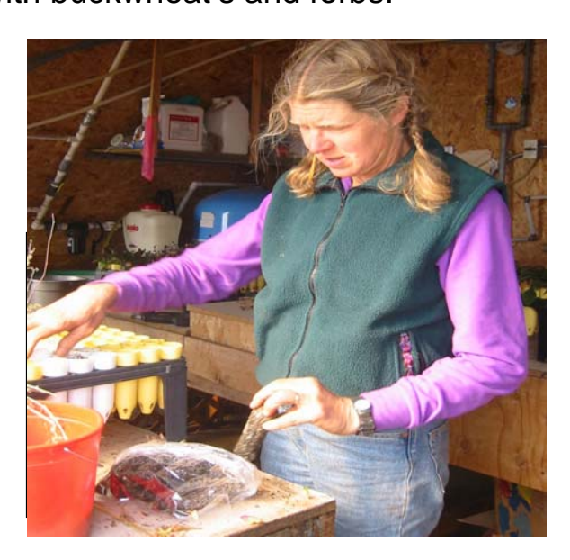
Planting rooted cuttings.

This year more sagebrush was planted along with buckwheat's and forbs.