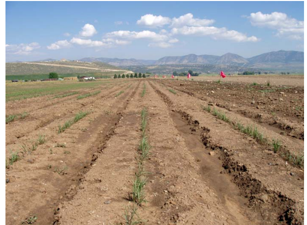
Blue Wildrye seed increase plot at the UCEPC in Meeker, CO. Yields are expected in 2008-2009.