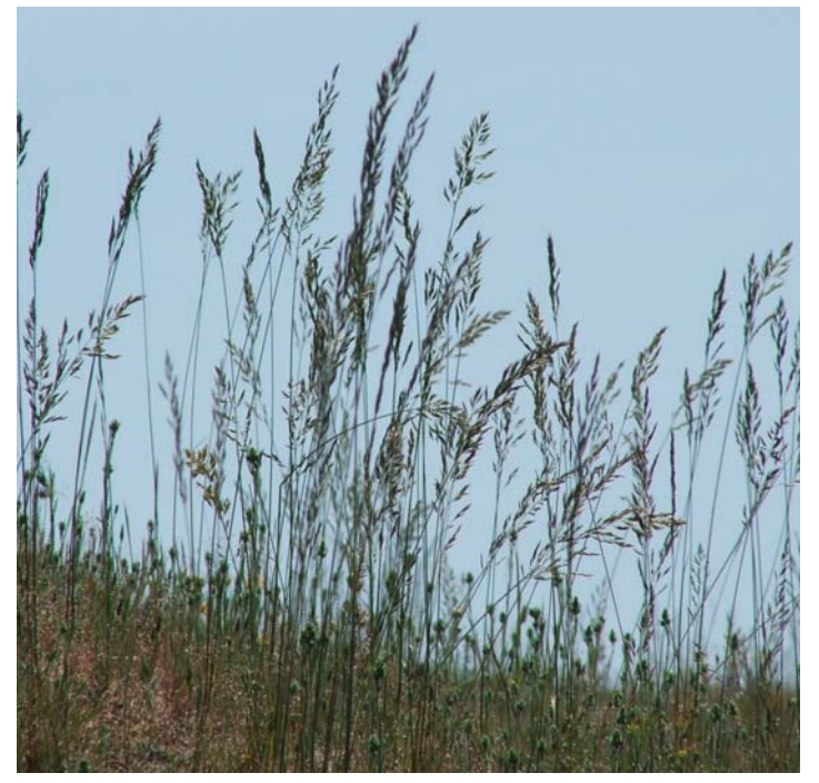
Figure 1. Poa secunda growing at Horse Rock Ridge BLM Natural Resource Area in western Oregon.

The goal of this larger project is to define seed movement guidelines for land managers that can guide the use of these important rangeland species in restoration activities. Once seed zones have been delineated, seed from this project will be used as foundation seed for grow-outs of locally adapted germplasm releases for specific regions.