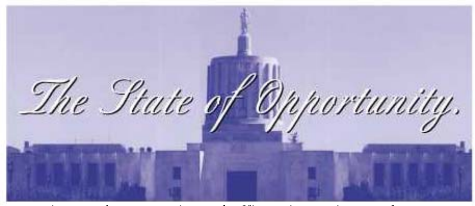
An equal opportunity and affirmative action employer.

In Oregon, Opportunity means a variety of careers available statewide, competitive salaries, and great benefits.