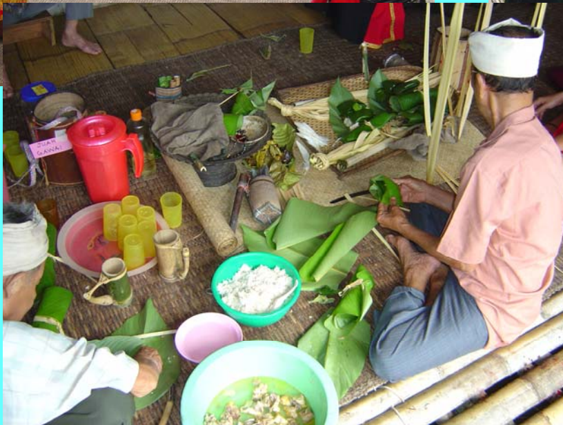
Borneo Bidayuh Kampung Longhouse Annah Rais, Padawan