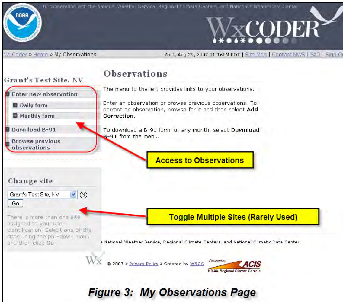
Figure 3: My Observations Page

From the WxCoder home page, you can select 'My Observations' from the main menu. This will take you to your 'My Observations' page ( Figure 3 ). Most observers enter data for only one cooperative station. For those with multiple stations a 'Change Site' box is provided to allow toggling of the default station referenced throughout the interface.