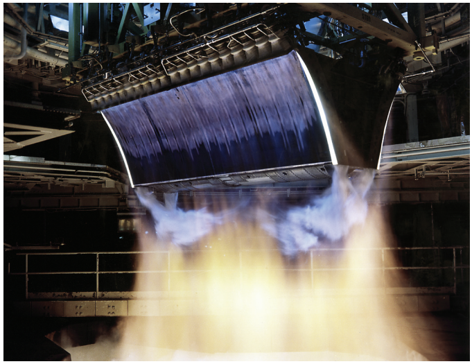
Testing of twin linear aerospike engines conducted in August 2001 at NASA's Stennis Space Center near Bay St. Louis, Miss.

includes the use of milled channel walls, featuring channels through which propellant can flow, in the engine's combustion chamber.