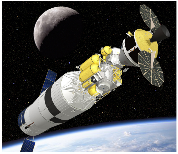
Concept image of the Ares V Earth departure stage in orbit, shown with the Orion crew module docking with the lunar lander module and Earth departure stage.

translunar injection. This second burn will last approximately 442 seconds to accelerate the mated vehicles to "escape velocity," the speed necessary to break free of Earth's gravity and travel to the moon. Then, the Orionlunar lander combination will perform a final maneuver to jettison the Earth departure stage and its J–2X engine and place them in orbit around the sun.