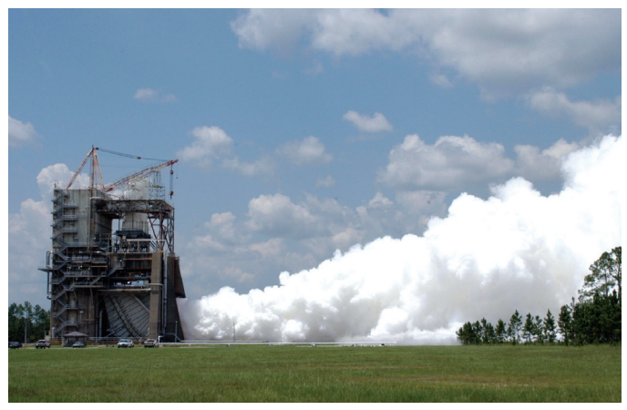
NASA conducts the last space shuttle main engine test on the Stennis A-1 Test Stand Sept. 29, 2006. The stand was transferred to the Constellation Program in November 2006.

Tests of the J–2X power pack and gas generator are planned for 2007. The test series will be conducted on the A-1 Test Stand at NASA's Stennis Space Center in Bay St. Louis, Miss. The test stand was built in the 1960s to test rocket engine stages for the Apollo Program. It was modified in the 1970s to test-fire and prove the flight readiness of all main engines for NASA's space shuttle fleet. The first integrated J–2X engine systems test is scheduled for 2010.