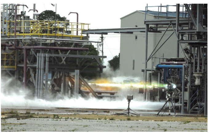
Subscale main injector hardware hot-fire testing at Marshall in June 2006.

Engineers at NASA's Marshall Center conducted hot-fire tests on subscale injector hardware in 2006 as part of an effort to investigate design options that would maximize performance of the J–2X engine for the Ares upper stages. The initial tests were performed on a variety of subscale injector designs. Data gathered from the tests is being used to design and develop the full-scale J–2X injector. Additional tests are planned.