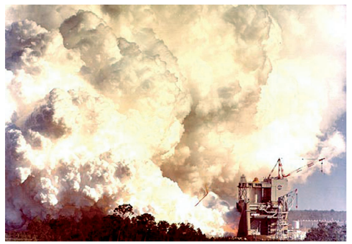
Test firing of a Saturn V second stage rocket in April 1966. The rocket used a cluster of five J-2 engines.