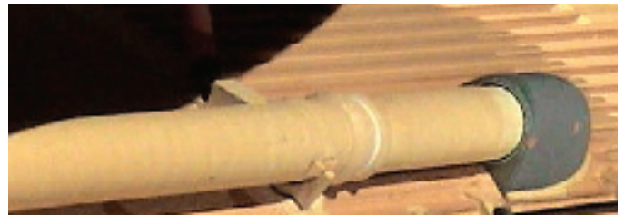
The redesigned bellows on tank ET-120.

Though the Space Shuttle Program decided the drip-lip configuration would be flown on STS-114, the External Tank Project