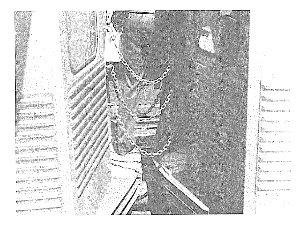
View of area between two rapid-transit cars. The lowest point of the top chain is about 26 inches above the platform. A 3-inch gap separates the platforms.