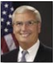
Stephen Johnson Administrator, Environmental Protection Agency Distinguished Guest Speaker