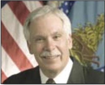
Ed Schafer Secretary of Agriculture USDA Keynote Address