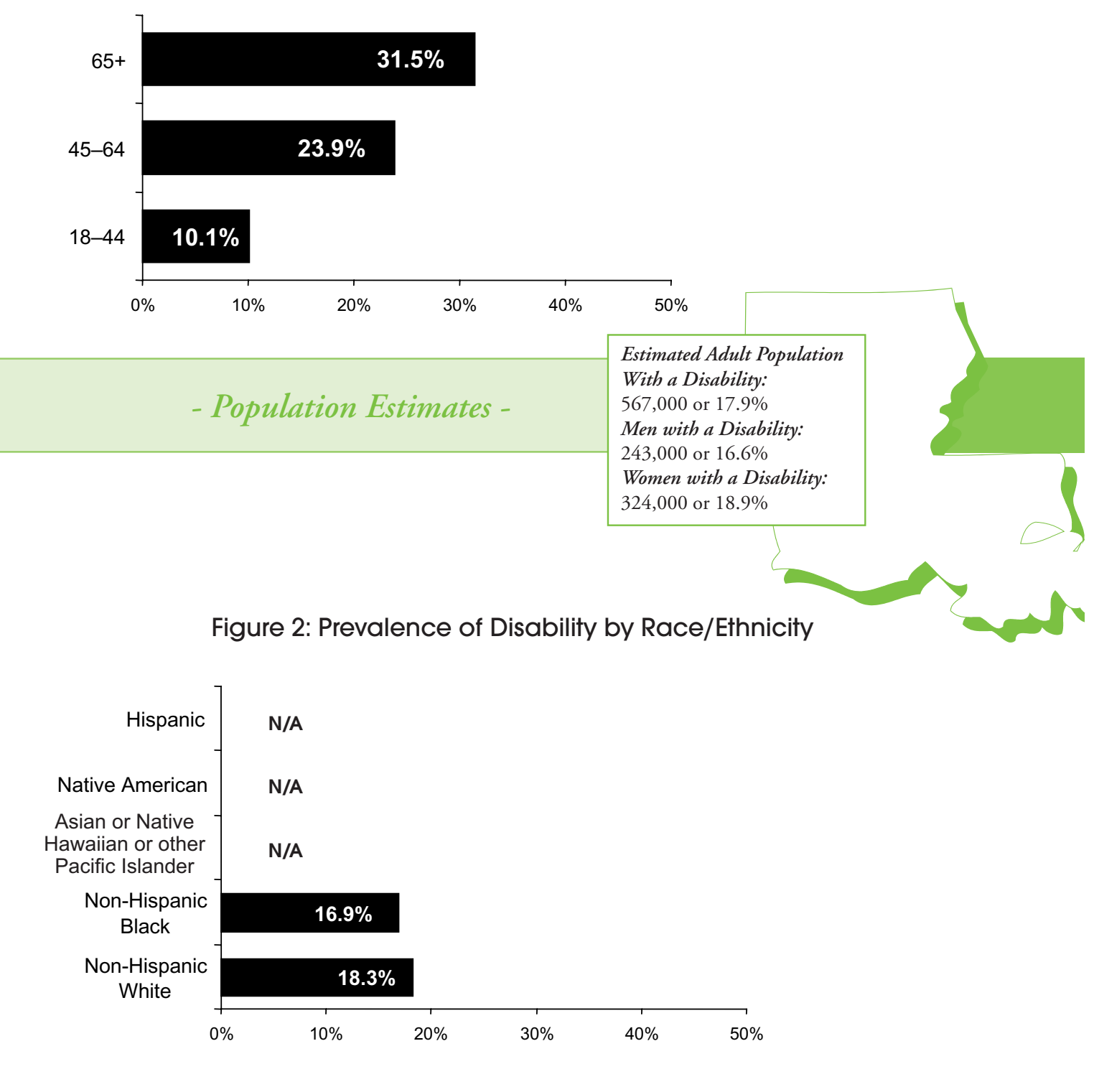
Figure 1: Prevalence of Disability by Age Group

N/A (Not Available): The estimate for this population group is not available because it is based on a sample smaller than 50 people or because the estimate lacks statistical precision.