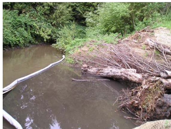
Holly Walla, 8-17-04