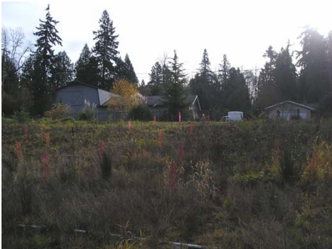
Holly Walla 12-07-05