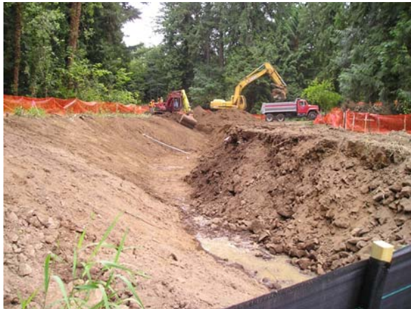
Holly Walla 7-9-04