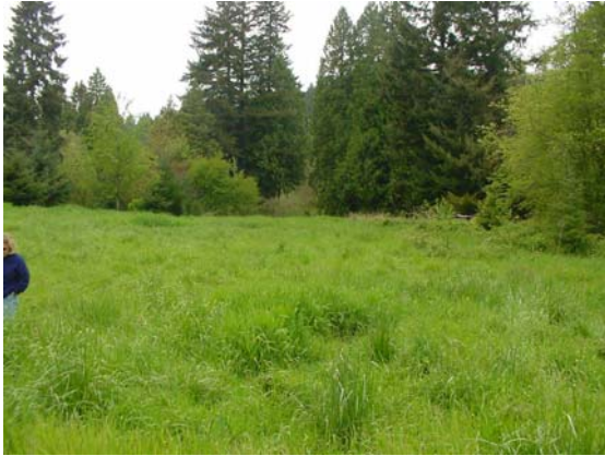
Kelley Main Channel, looking NW Holly Walla 5-30-02