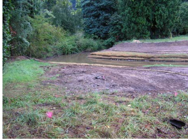
Looking East, Nadine Bole, 8-25-04