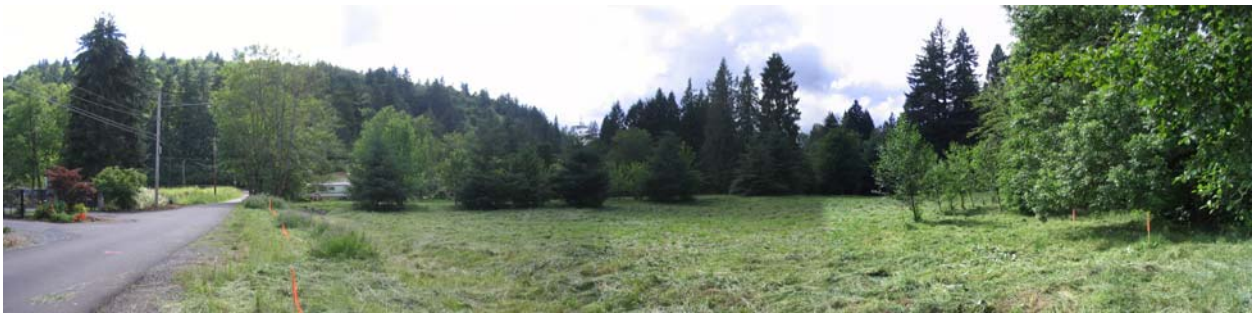
Project site, looking West, Holly Walla 2-18-04