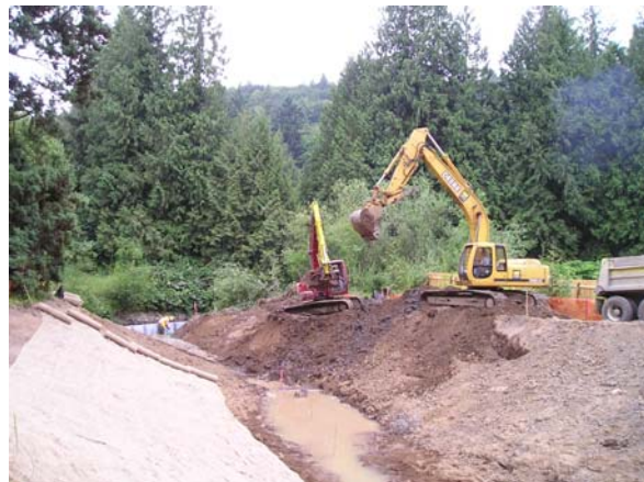
Holly Walla, 8-2-04