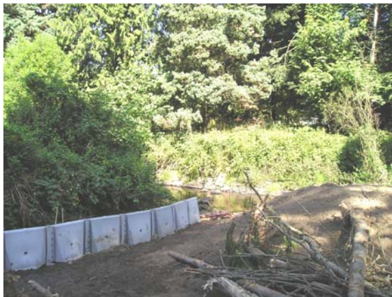
Holly Walla, 8-17-04