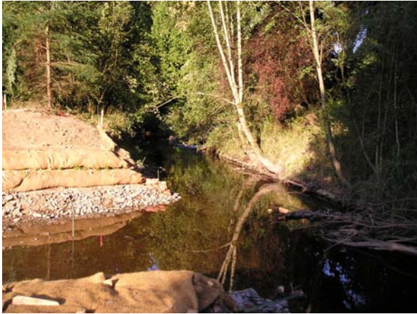
Looking W, Holly Walla, 8-25-04