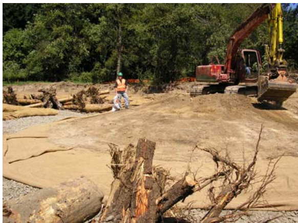
Looking at point bar across from Logjam # 2 Nadine Bole 8-02-04