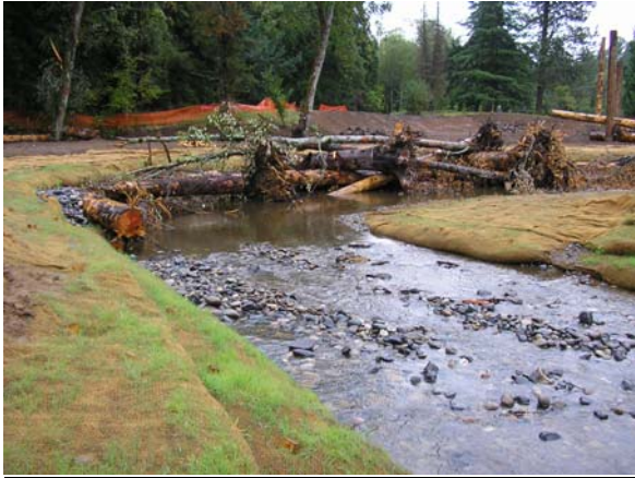
Looking SE, Nadine Bole 8-22-04