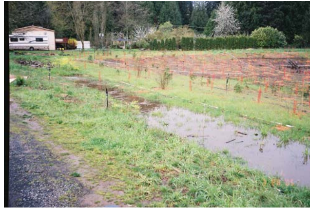
After Construction, Nadine Bole, 3-28-05