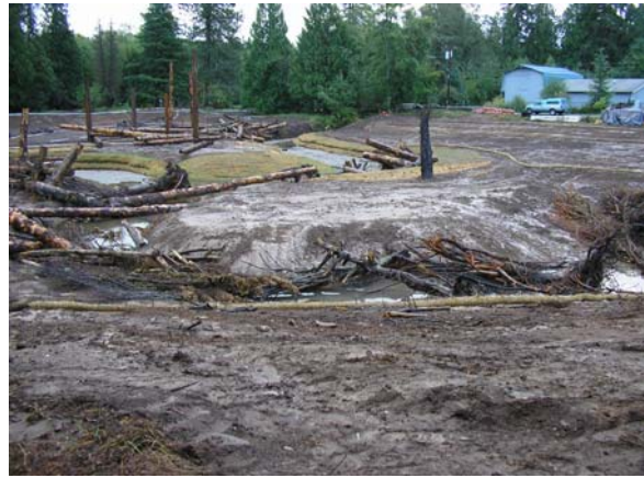
Looking SE, Nadine Bole 8-25-04