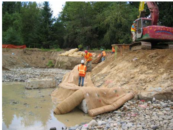
Between Logjams 2 & 3, Holly Walla, 7-30-04