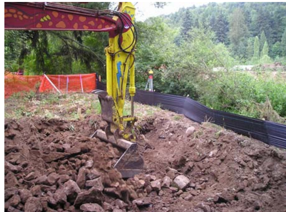
Pulling soil plug 7-9-04