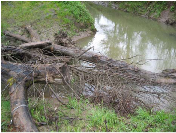
Holly Walla 4-8-05