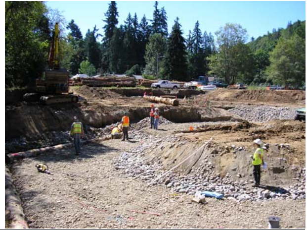
Looking S, Nadine Bole, 7-23-04