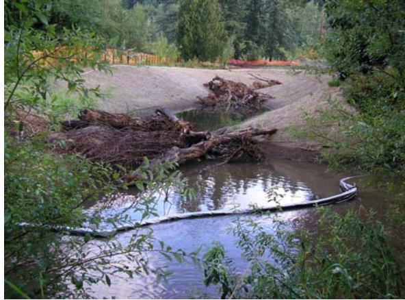
Nadine Bole, 8-5-04