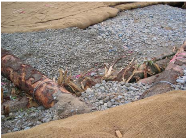
Holly Walla, 8-11-04