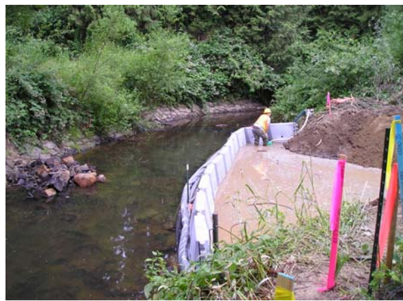
Holly Walla, 8-17-04