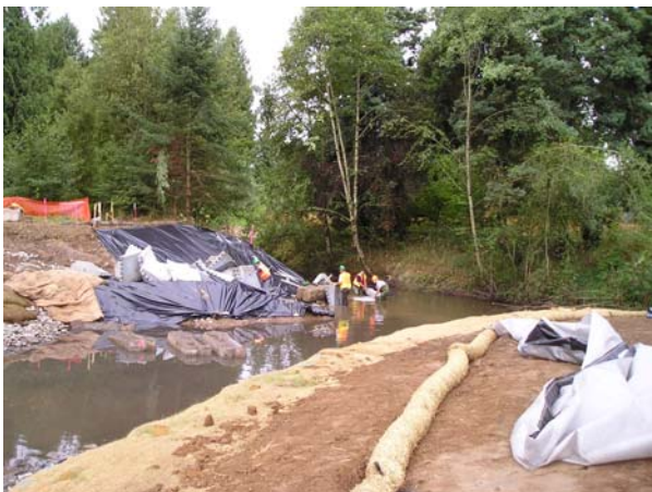
Holly Walla 8-6-04