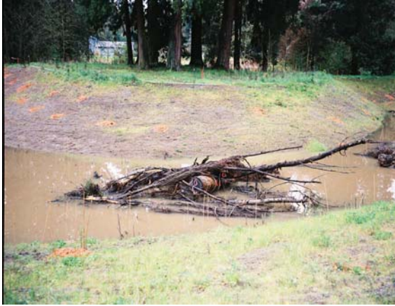
Nadine Bole, 3-23-05