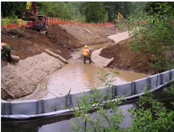
Holly Walla, 8-17-04