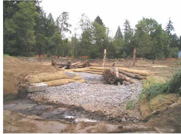
Looking S, Holly Walla, 8-5-04