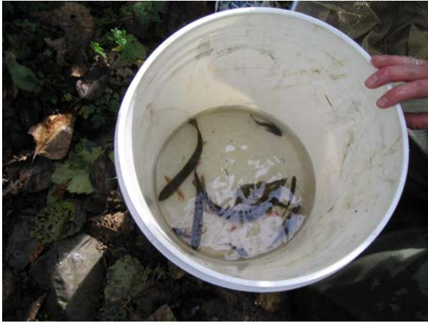
Cut-bows and Sculpin, just upstream of project site Chad Smith 10-27-05