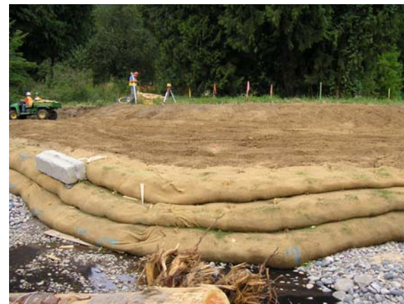
Building soil wall Nadine Bole 8-3-04