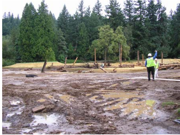
Looking Southwest & West, Nadine Bole 8-26-04