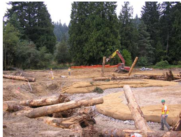
Logjam #2 in front, Logjam #3 in Back, Nadine Bole 8-02-04