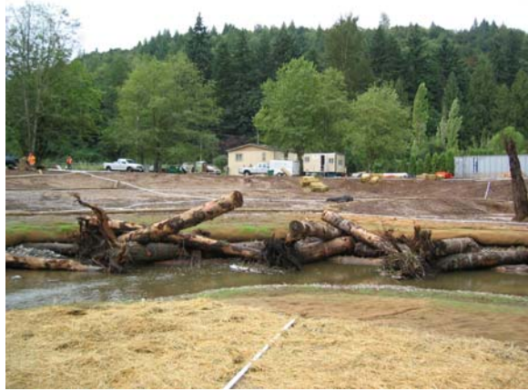
Looking SW Holly Walla 8-26-04