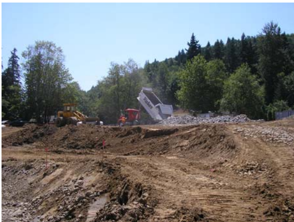
Beginning grading, Nadine Bole 7-28-04