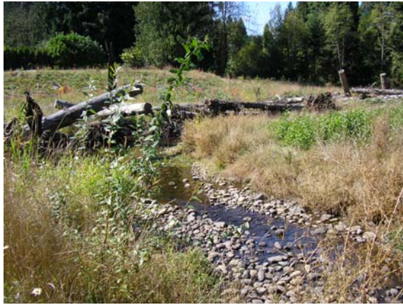
Looking N, Nadine Bole, 9-15-04