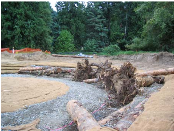
Looking N, Holly Walla, 7-30-04