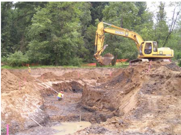
Looking SW, Holly Walla 7-06-04