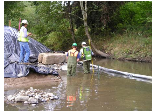
Holly Walla 8-5-04