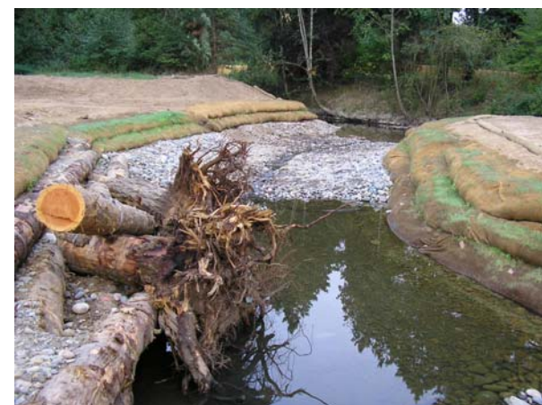
Nadine Bole 8-19-04