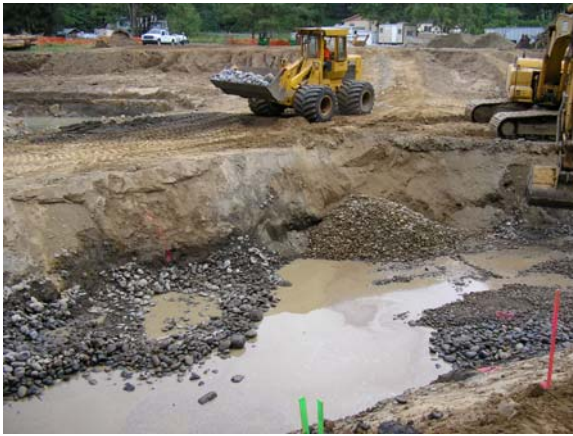
Looking SW, Nadine Bole 7-17-04