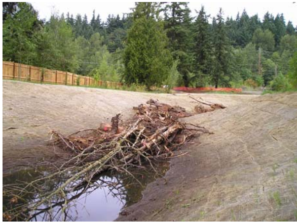
Holly Walla, 8-17-04