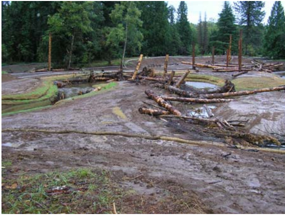
Looking E, Nadine Bole 8-25-04