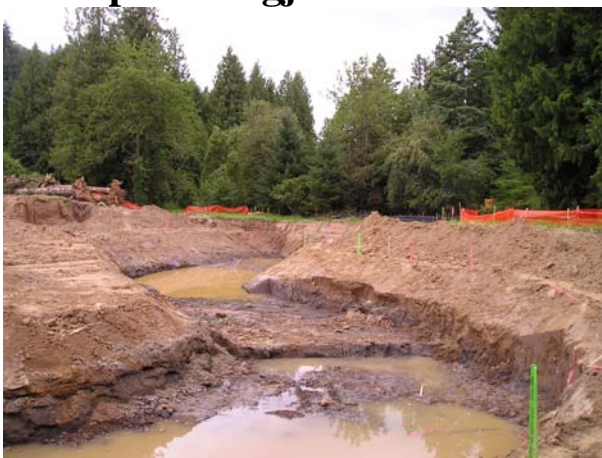
Looking N, Holly Walla, 7-6-04