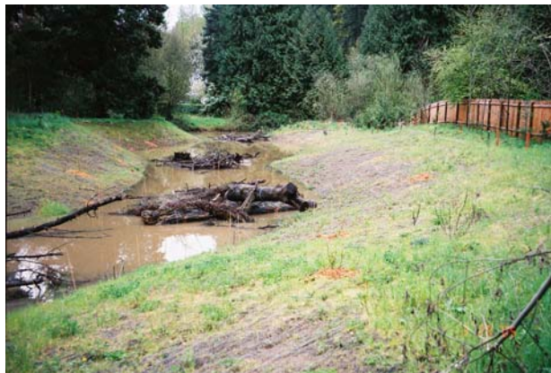
Nadine Bole, 3-28-05