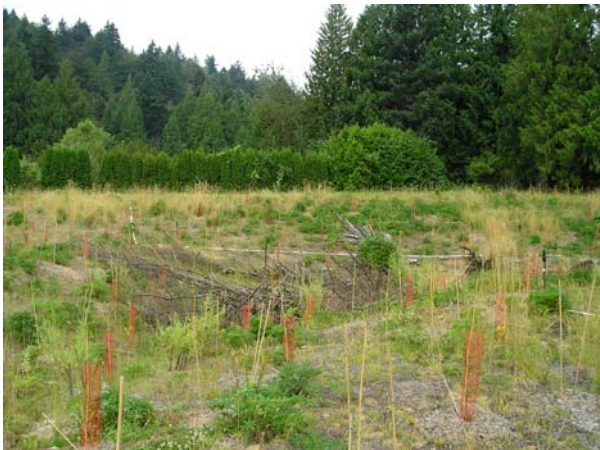
Looking NW , Helena Abernathy, 7-25-05