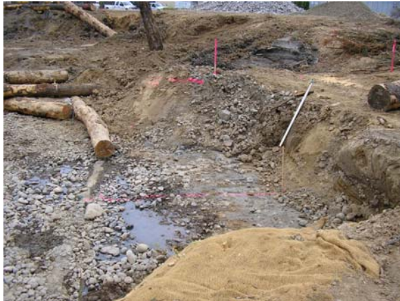
Footer Log for LogJam, Nadine Bole 8-02-04