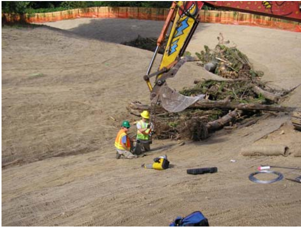
Nadine Bole, 8-4-04