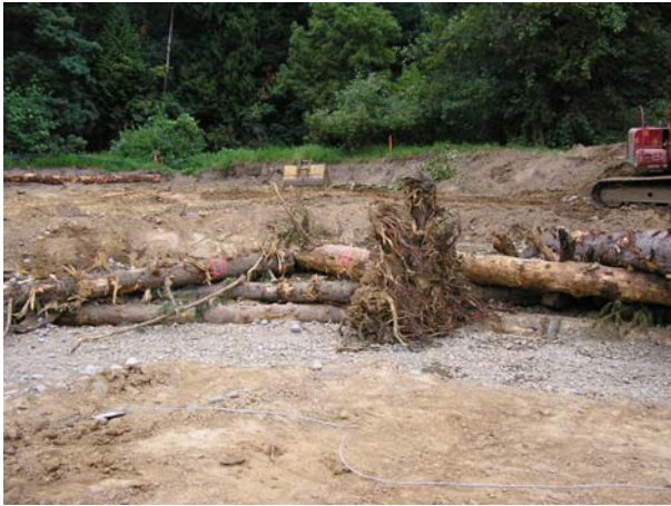
Looking NE, Nadine Bole 7-26-04