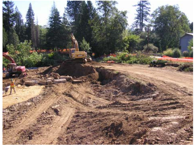
Looking SE, Nadine Bole, 8-10-04