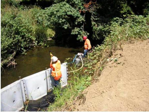
Nadine Bole 8-3-04