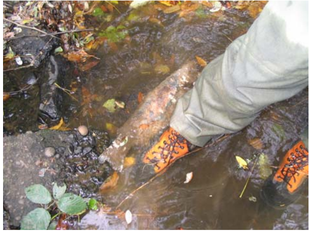
Coho in Kelley Creek, just upstream of project site Chad Smith 10-27-05