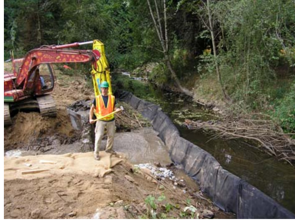
Nadine Bole 8-4-04