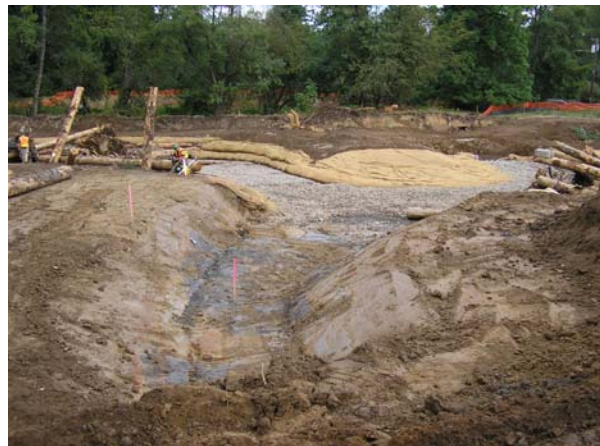
Nadine Bole 8-5-04