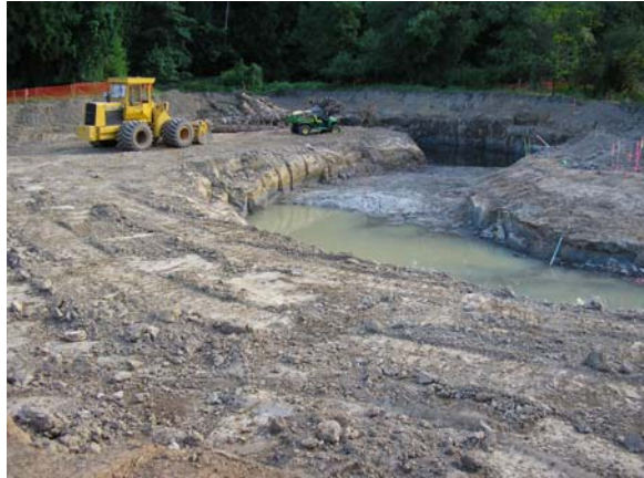
Looking N, Nadine Bole 7-17-04