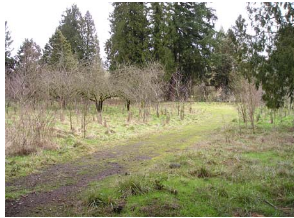
Right Backwater Channel, Holly Walla 2-18-04