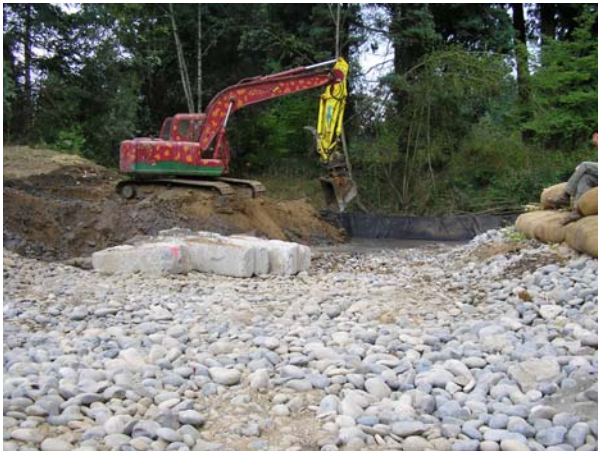
Nadine Bole 8-04-04