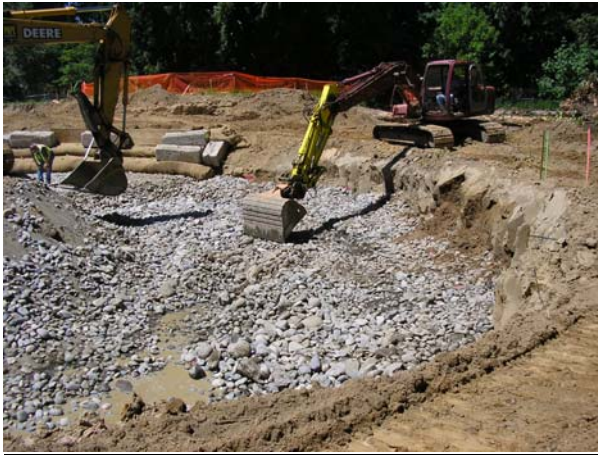
Looking N, Nadine Bole, 7-21-04