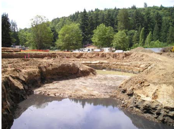
Looking SW, Holly Walla ,7-6-04