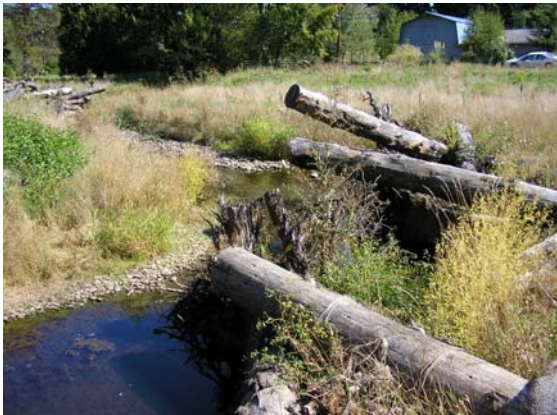
Looking S, Nadine Bole 9-15-04