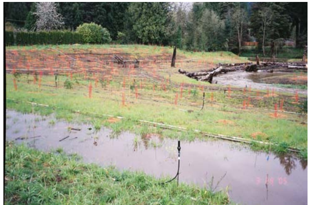
Looking N, Nadine Bole 3-28-05