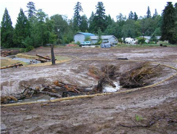
Looking S, Nadine Bole 8-25-04