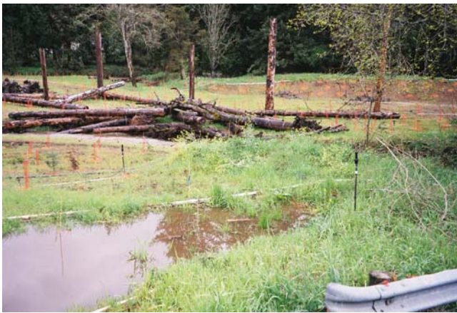
Looking NE from 159 th Ave , Nadine Bole 9-14-05