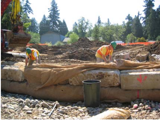
Lift construction along Riffle between logjams 1 & 2, Holly Walla, 8-11-04