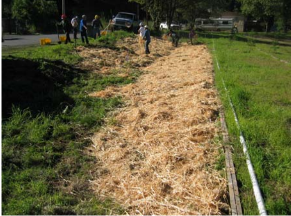
Holly Walla 10-14-04