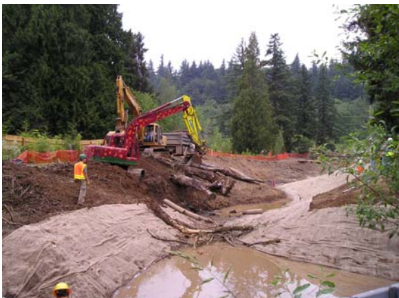
Holly Walla, 8-2-04