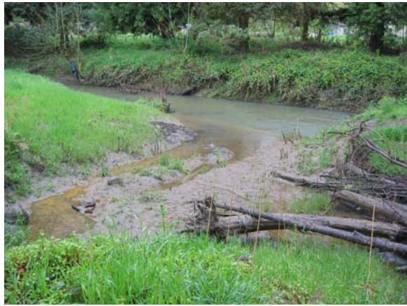
Holly Walla 4-8-05