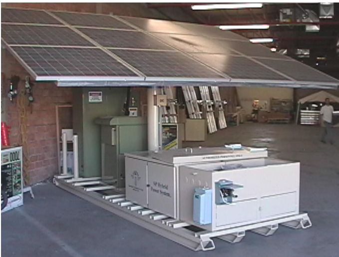
Construction of Photovoltaic Fuel Cell Mobile Unit

In addition to this research and development exchange, the City has recently partnered with Sacred Power to build and demonstrate a 2kW PV/Hybrid with a 5kW fuel cell.