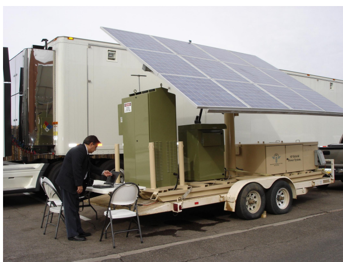
Dave Melton with Photovoltaic/Fuel Cell Mobile Unit.

The ECC succeeded in establishing a solar subcommittee aimed at developing a strategic plan for various programs. This subcommittee developed and pursued additional mechanisms for implementing solar renewable projects within City