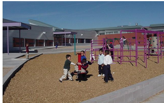
Edward Gonzalez Elementary, First APS "E School."

An APS pilot program that pays schools to reduce their electricity usage is being hailed a success, returning funds to participating schools in the program. Launched in the fall of 2000-2001 nine Sandia Cluster Schools, the program has proved so popular that it has over a third of the district schools in the 2004-2005 school year. The "Energy Conservation