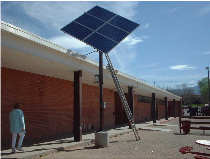
Cleveland Middle School. Example of Solar Photovoltaic at an APS Facility.