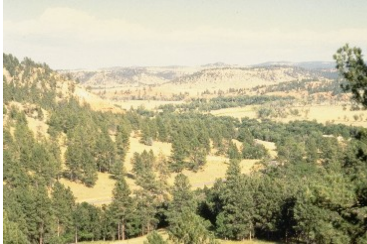
Figure 1-5. Devils Tower, view from west of Monument Headquarters