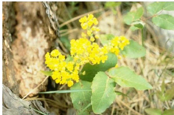
Figure 1-4. Mahonia repens