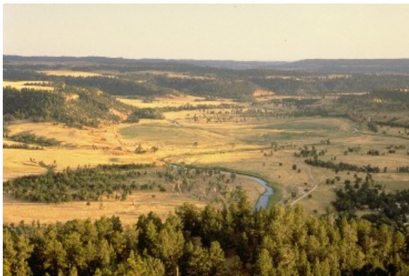
Figure 1-3. View of Belle Fourche River southeast from the base of the tower.