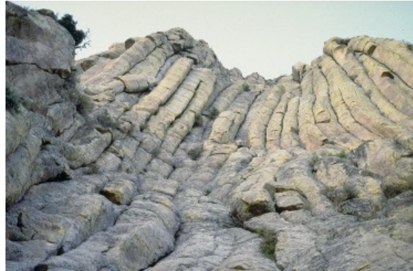
Figure 1-2. Devils Tower, view of tower from the southeast side.