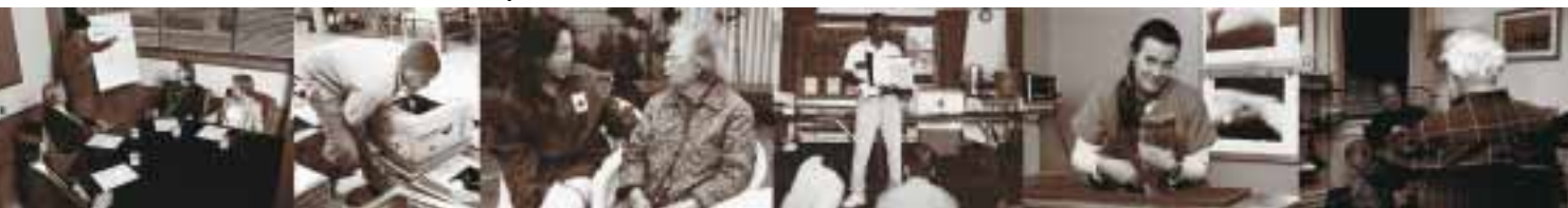
From left, photos 4 and 6 courtesy of Capital Area Food Bank of Austin, Texas; photos 7 and 8 courtesy of American Red Cross.

efficiency and problemsolving skills. They design educational, social, and entertainment programs for residents, and they enforce house rules.