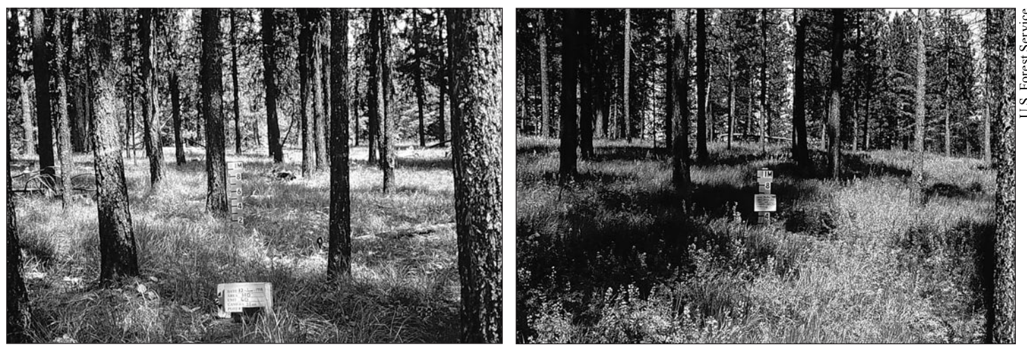
The images above show the same stand before and after a thinning treatment followed by a prescribed burn. Thinning removed some of the medium-sized trees, whereas fire eliminated the smallest trees, creating stand conditions more closely aligned with restoration goals.

"Our hope is that managers will be able to look at the findings from across the network and say, for example: Since there's been a common response across all the sites similar to mine, I can be fairly certain that the same thing will occur."