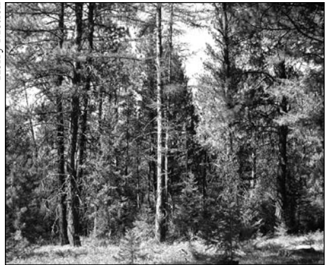
Fire suppression and past logging practices have resulted in unnaturally high tree densities, which has increased the probability of severe wildfires, insect outbreaks, and drought-related mortality.

Today, largely owing to a century of fire suppression and past logging practices, many fire-dependent forests are shadows of their former selves. Large trees typically remain, but they are inundated by young trees and woody shrubs that have established in the absence of fire. These small trees create a continuous ladder of woody vegetation from the ground to the treetops and dramatically increase competition for water, nutrients, and light. In many cases throughout the West, the absence of fire in dry forests has led to a shift in tree species from fire-resistant ponderosa pine and Douglas-fir to grand fir and other species intolerant of fire.