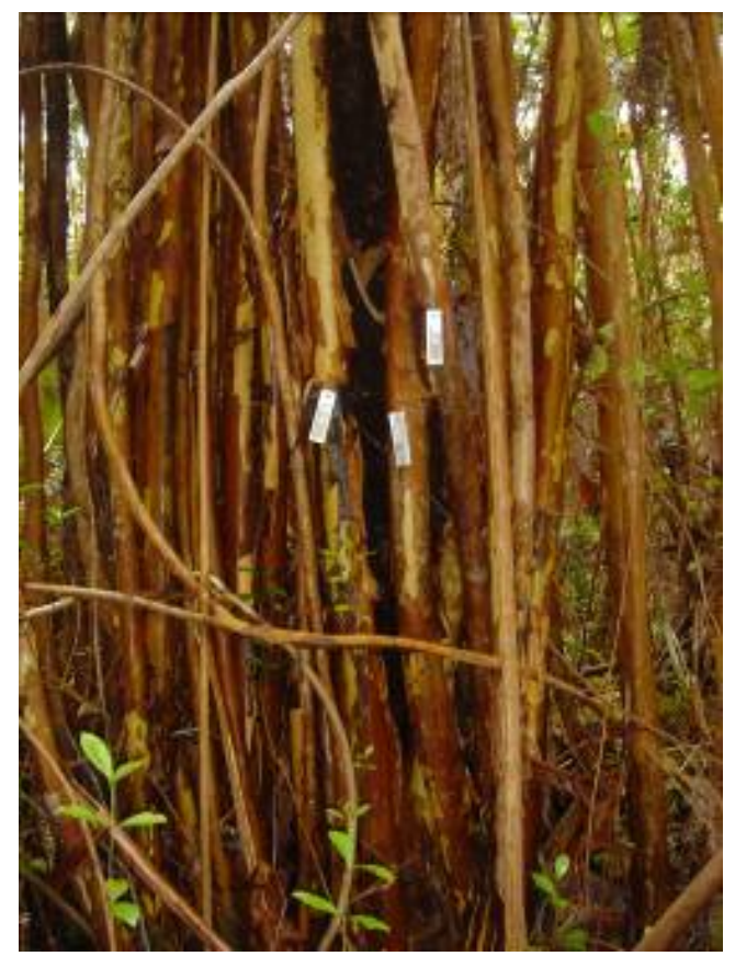
Ground view of strawberry guava thicket in Ola`a Forest Reserve