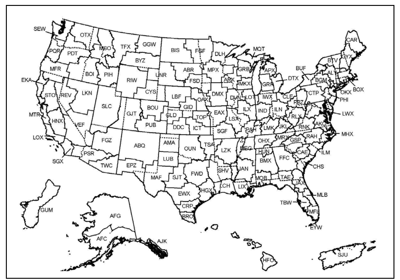
Figure 2. WFO hydrologic service areas.

<u>Albany, NY (ALY)</u> – portions of eastern New York, northwest Connecticut, western Massachusetts, and southern Vermont.