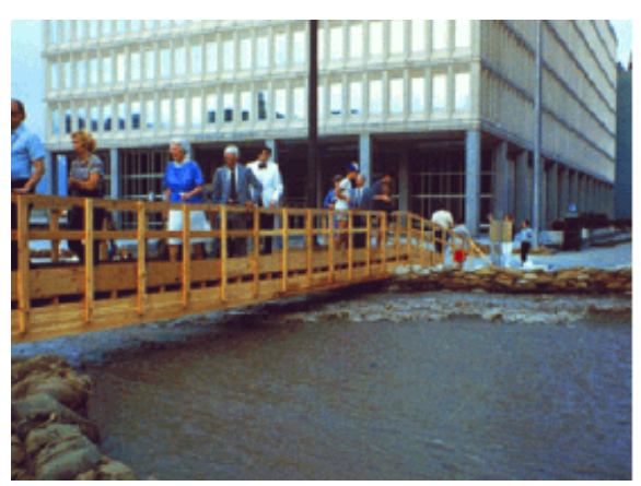
AHPS provide forecasts of river levels and river flow volumes from an hour to a season for areas large and small. With advance knowledge, communities can minimize flooding impacts. This community contained their floodwaters with sandbags and built a temporary bridge.