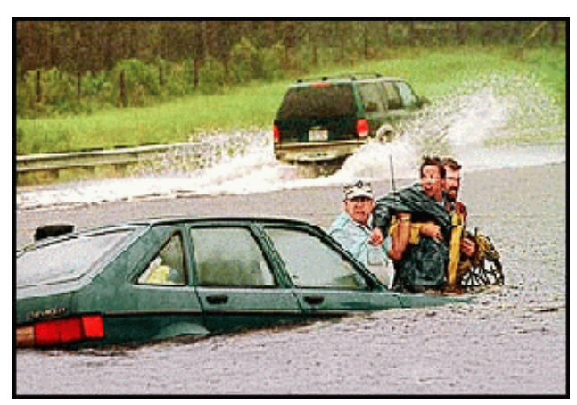
In an average year, more than 130 people are killed by flooding and flash flooding.