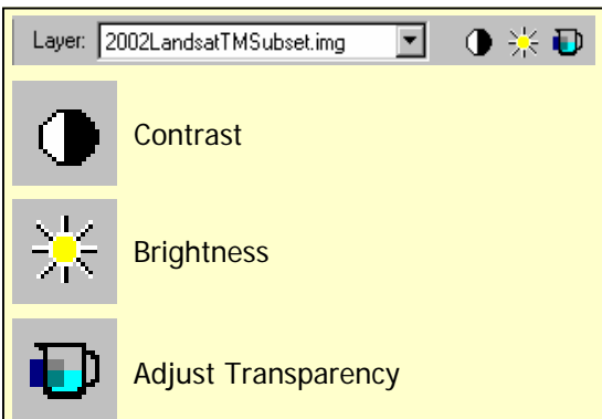
This graphic illustrates the Effects toolbar and its associated buttons— Contrast , Brightness , and Adjust Transparency .

Toggle Images indicates that you switch between two or more images being displayed in the Data View.